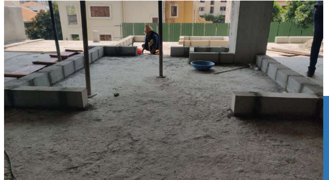
Block Works in Progress