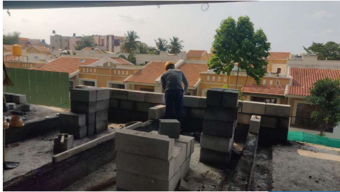
Block Works in Progress