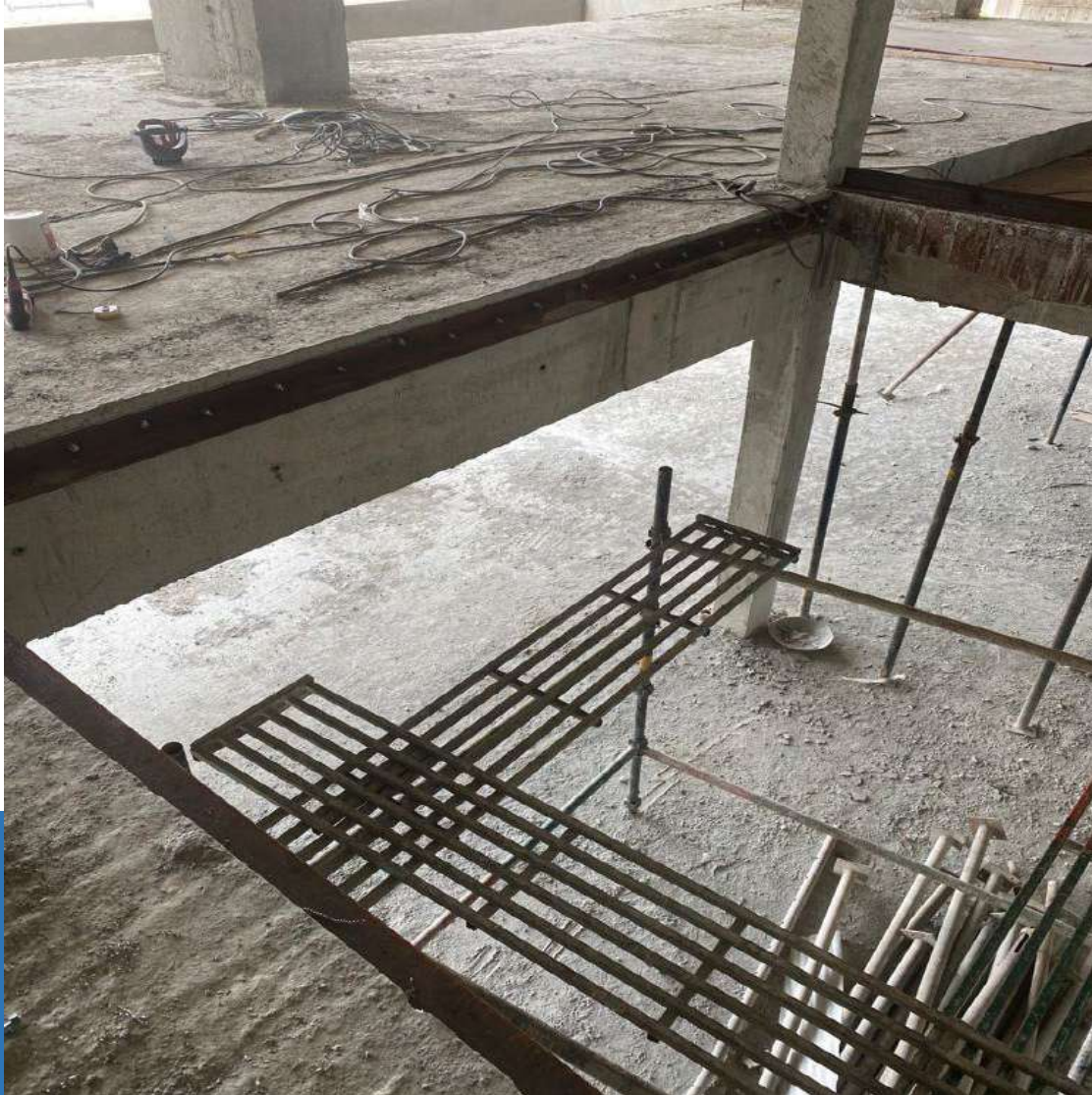
MS works for slab closing works in progress