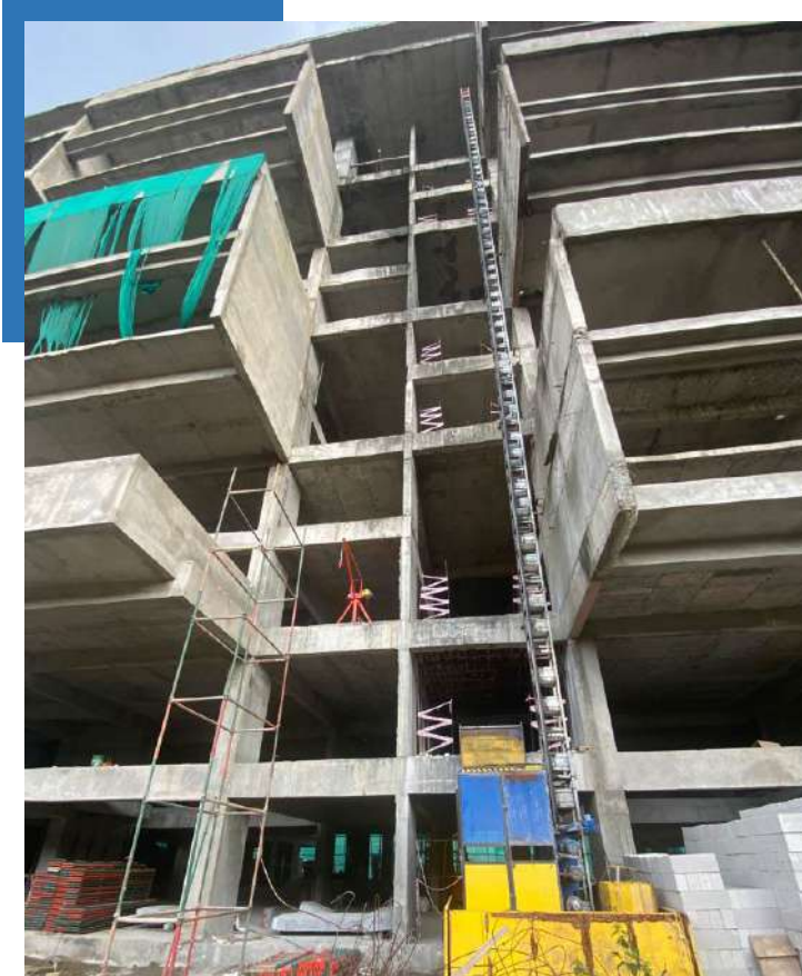
Passenger hoist installed