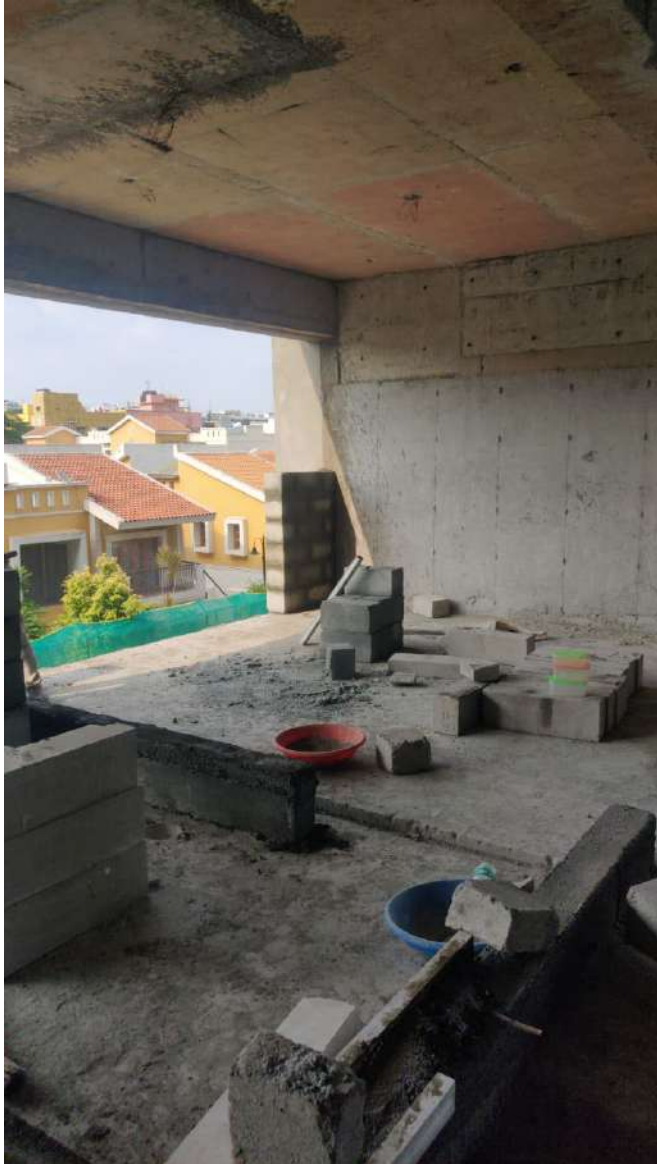
Block Works in Progress