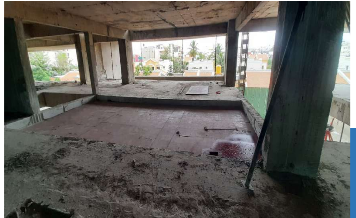
Slab casting works in progress