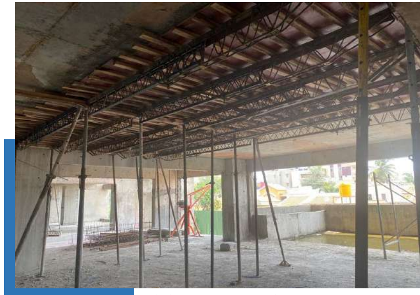
Slab casting works in progress