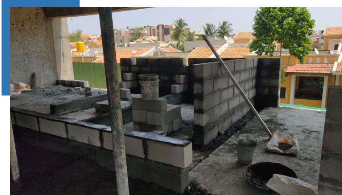
Block Works in Progress