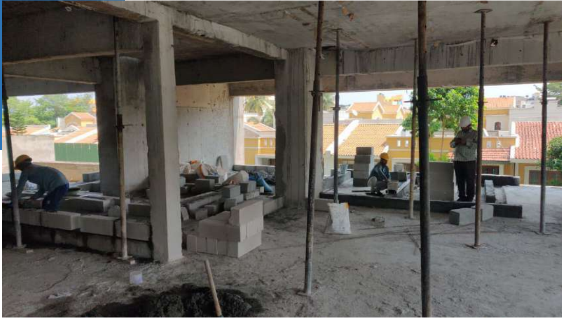
Block Works in Progress