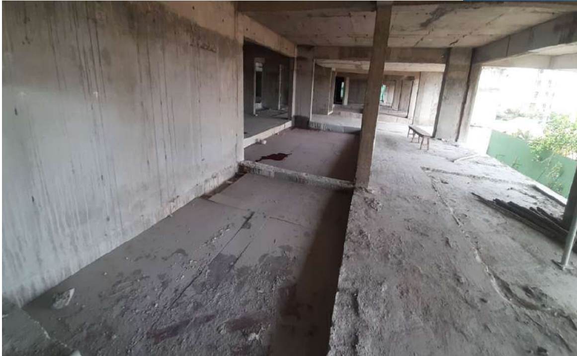
Slab casting works in progress