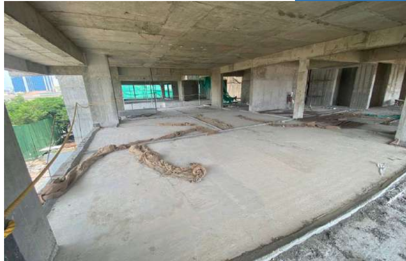
Slab casting works in progress